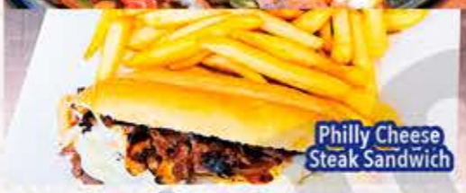
Philly Cheese Steak Sandwich